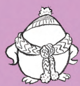
4. Put her flippers on her hips to make her look impatient.