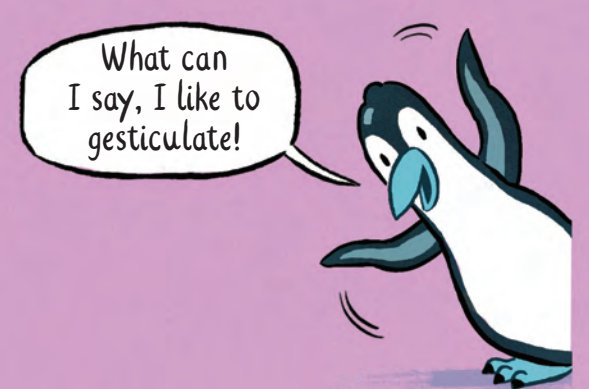
5. Draw a line from his beak. round the edge of his body and back to his beak. The outer part can be filled in black. You can fill in his claws too.