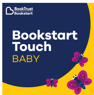
Bookstart Touch Baby Pack

It's likely you received this leaflet in one of the packs below. To find out which additional free Bookstart packs you are eligible for, contact your local health visitor, library or children's centre.