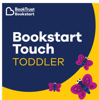
Bookstart Touch Toddler Pack