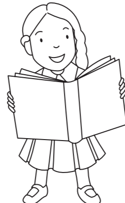
Siarad am luniau mewn stori