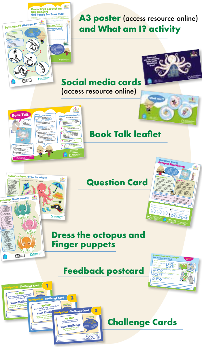
A3 poster (access resource online) and What am I? activity

Please find enclosed all the Book Talk resources. Inside the box you'll find one of each of the following items for every child taking part, plus one additional copy for you to use and keep in the nursery: